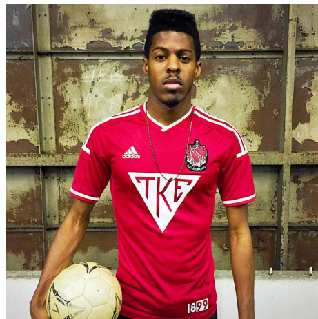
For the crest on the front, not the name on the back. #IAMTKE