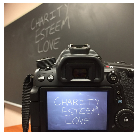
Three Words. One Fraternity. #IAMTKE

Every moment on campus is an opportunity for a photo: a flag on campus during Bid Day; new uniforms for intramurals; creative moments after class. While there are plenty of moments you can capture, the more important aspect to keep in mind is what you should share.