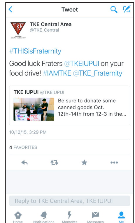
Example of sharing positive work of other chapters and organizations.

Tau Kappa Epsilon has three official accounts to keep you in the know: @TKE_Coastal; @TKE_Central; and @TKE_Fraternity. Each account mixes in appealing visuals to improve the message of each Tweet. From a photo to a link to a quote retweet, we'll keep sharing your positive work with the world.