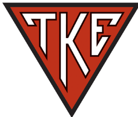
Alpha Illinois Wesleyan University

Download your official social media icon for free at tke.org/logos . Contact the Offices of the Grand Chapter at tkeogc@tke.org with questions/requests.