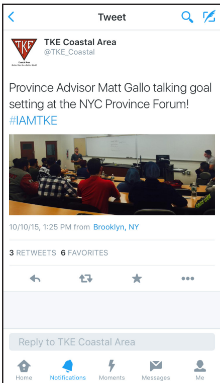
Example of sharing a photo with a short explanation of the event.

A Tweet consists of 140 characters, but that doesn't mean it's confined to plain text. You'll notice that a significant amount of replies, retweets and favorites include some sort of imagery, whether it be still photos, videos or GIFs. Make the most out of each character by adding media when possible, but don't spoil a good Tweet with an unappealing photo.