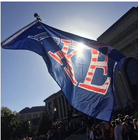
Tekes at Oregon State put their own spin on the classics. #IAMTKE

It's not a coincidence Instagram usage has doubled since 2012 while Facebook and Twitter's growth has stagnated. Images evoke feelings far quicker than any writing can hope to accomplish. Now, a photo with a quick, one-punch line? That's a winning combination.