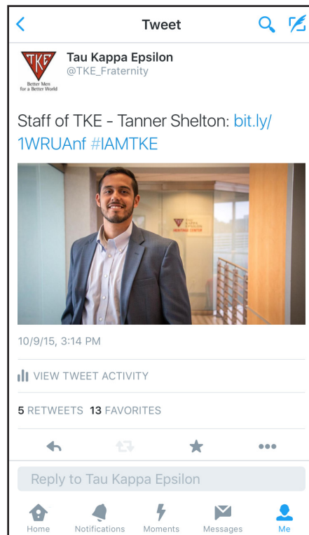
Example of a story highlighting an individual associated with the Fraternity.