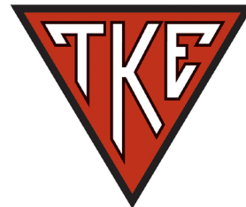
Beta-Chi Alumni Association