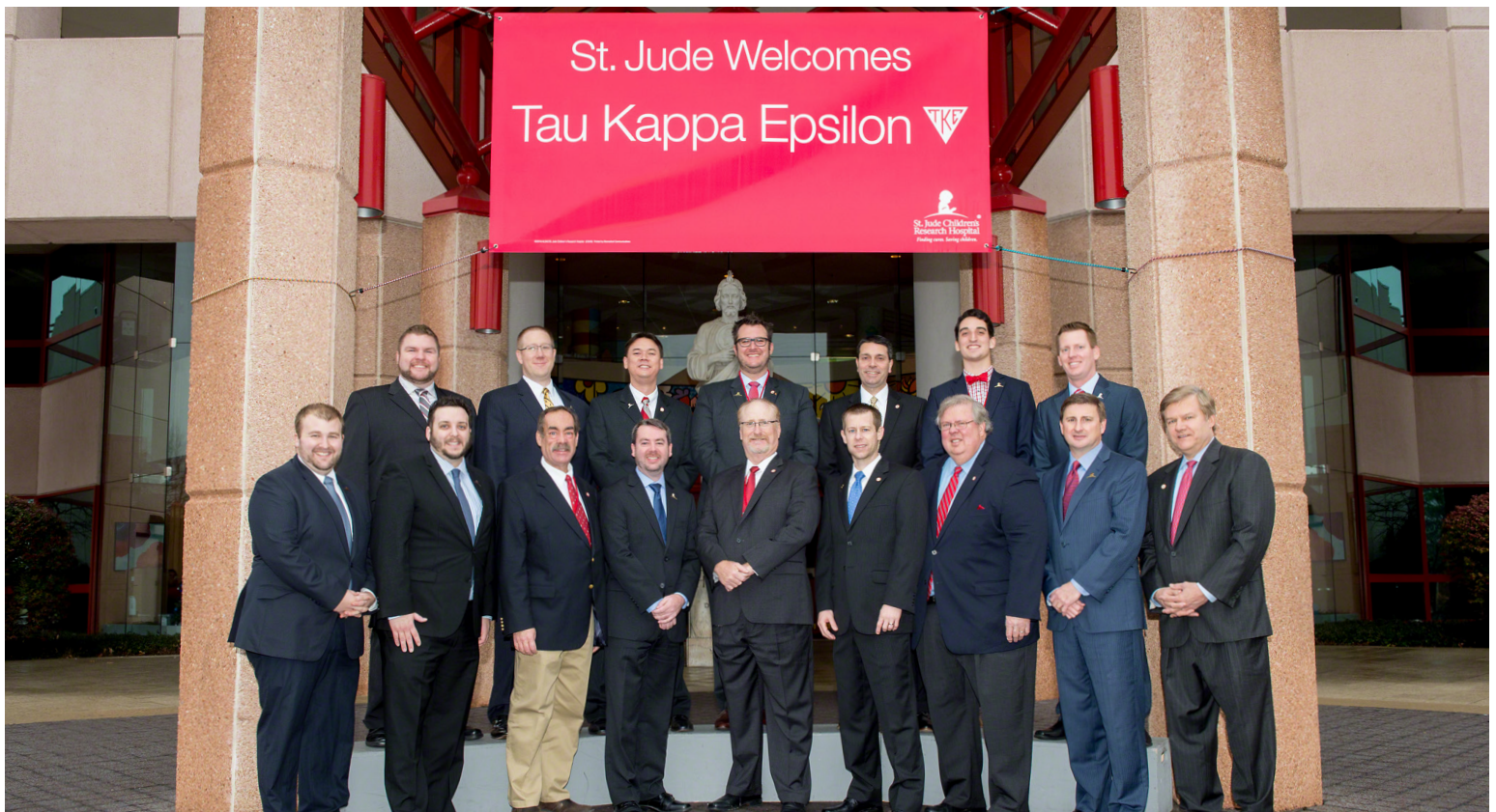
Grand Council visits St. Jude Campus to discuss our $2.6 million commitment to the hospital.

As the 2019 Regional Leadership Conferences drew to a close, Tau Kappa Epsilon announced the completion of our $2.6 million commitment, nearly 3 years ahead of schedule! Fraters would wait until the Fraternity gathered for the 2019 Conclave in Orlando, FL to learn of our next commitment with St. Jude Children's Research Hospital.