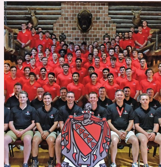
Leadership Academy Reception (Thursday)