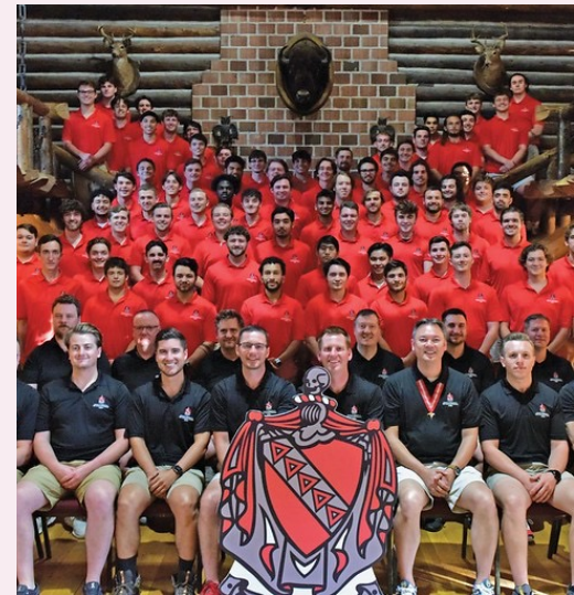
Leadership Academy Reception (Thursday)