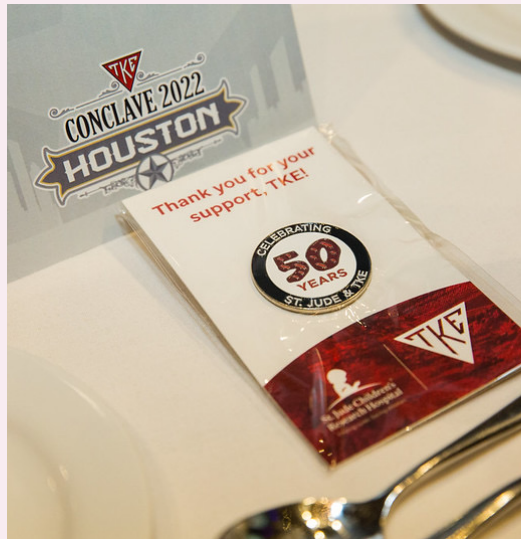
Name on Signage, Workbook, Advertisement, Communications, Speaking