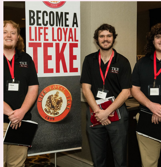
Alumni Life Loyal TKE Reception (Friday)