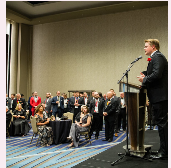
TKE Foundation Reception (Saturday)