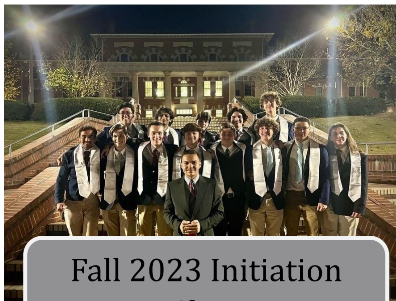
Fall 2023 Initiation Class