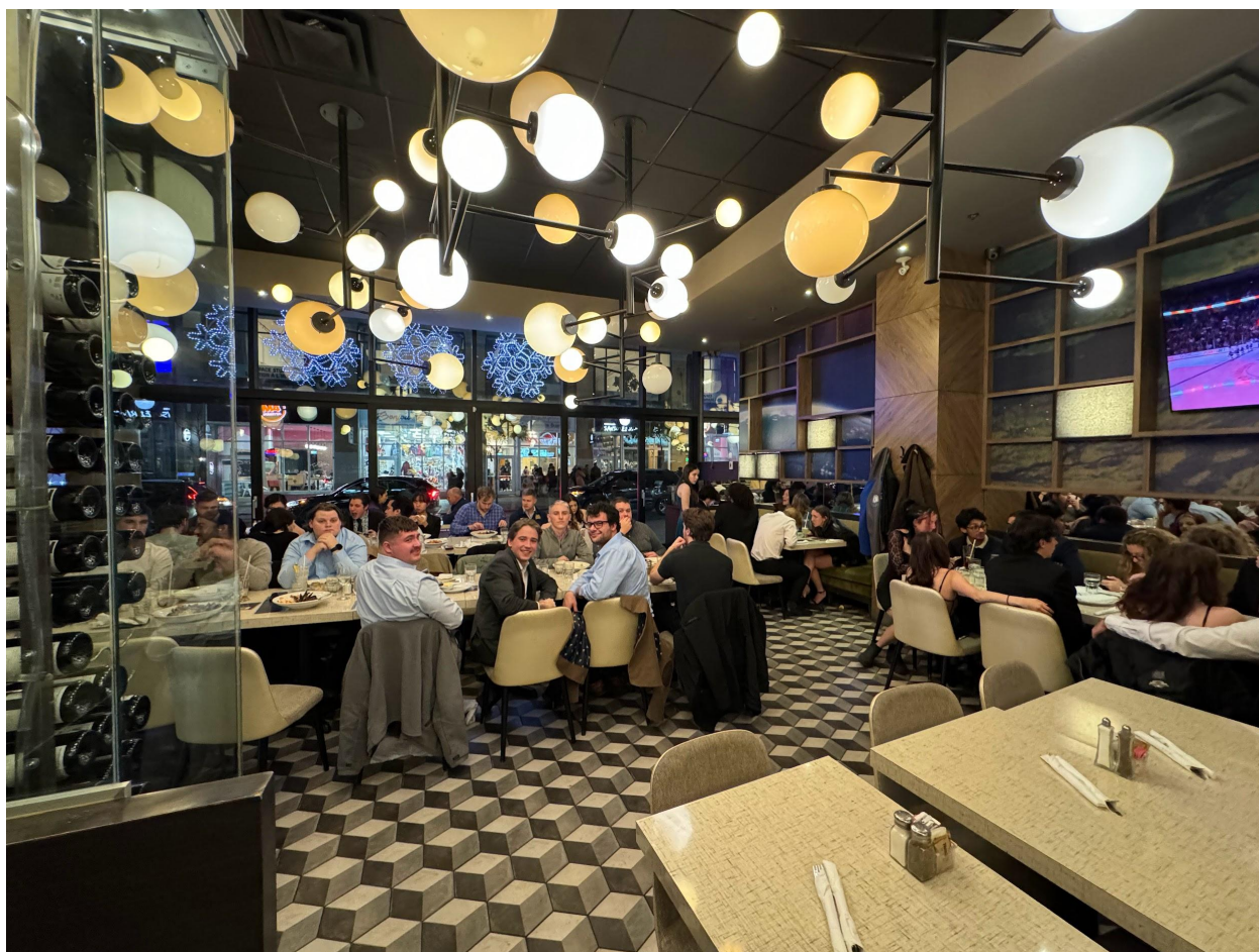
Dinner venue: Universel Déjeuner Grillades