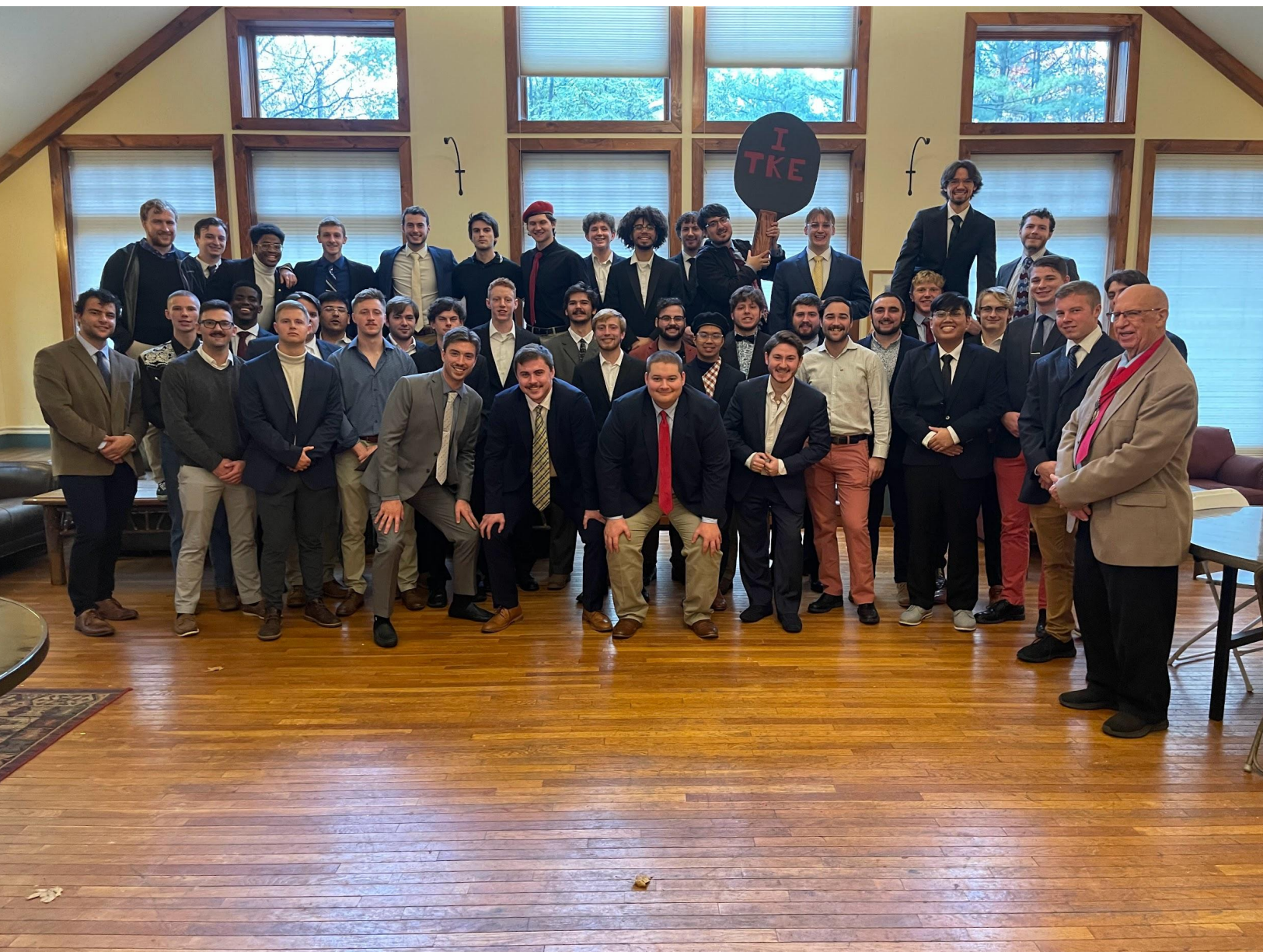
All Fraters that attended Upsilon Class Initiation