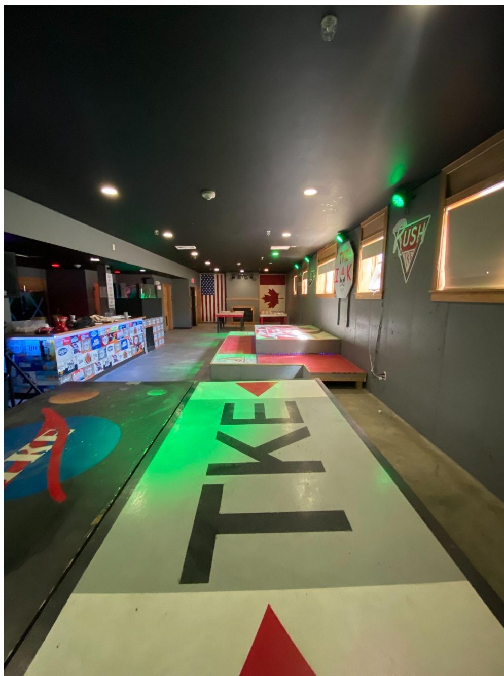
View of basement well lit