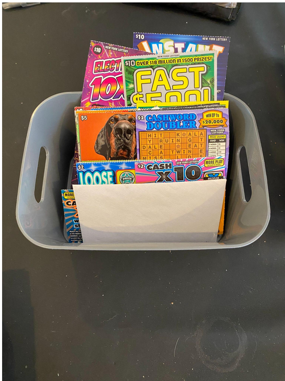
Lotto Basket for basket raffle