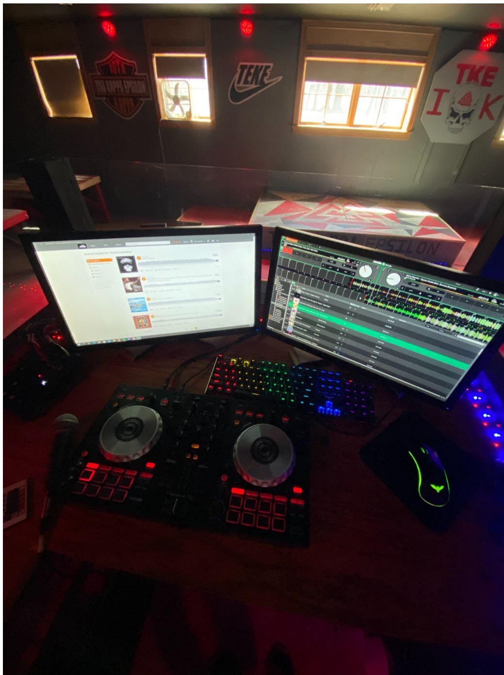
View from behind DJ Booth