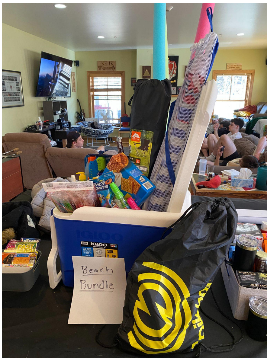
Beach Bundle Basket for basket raffle