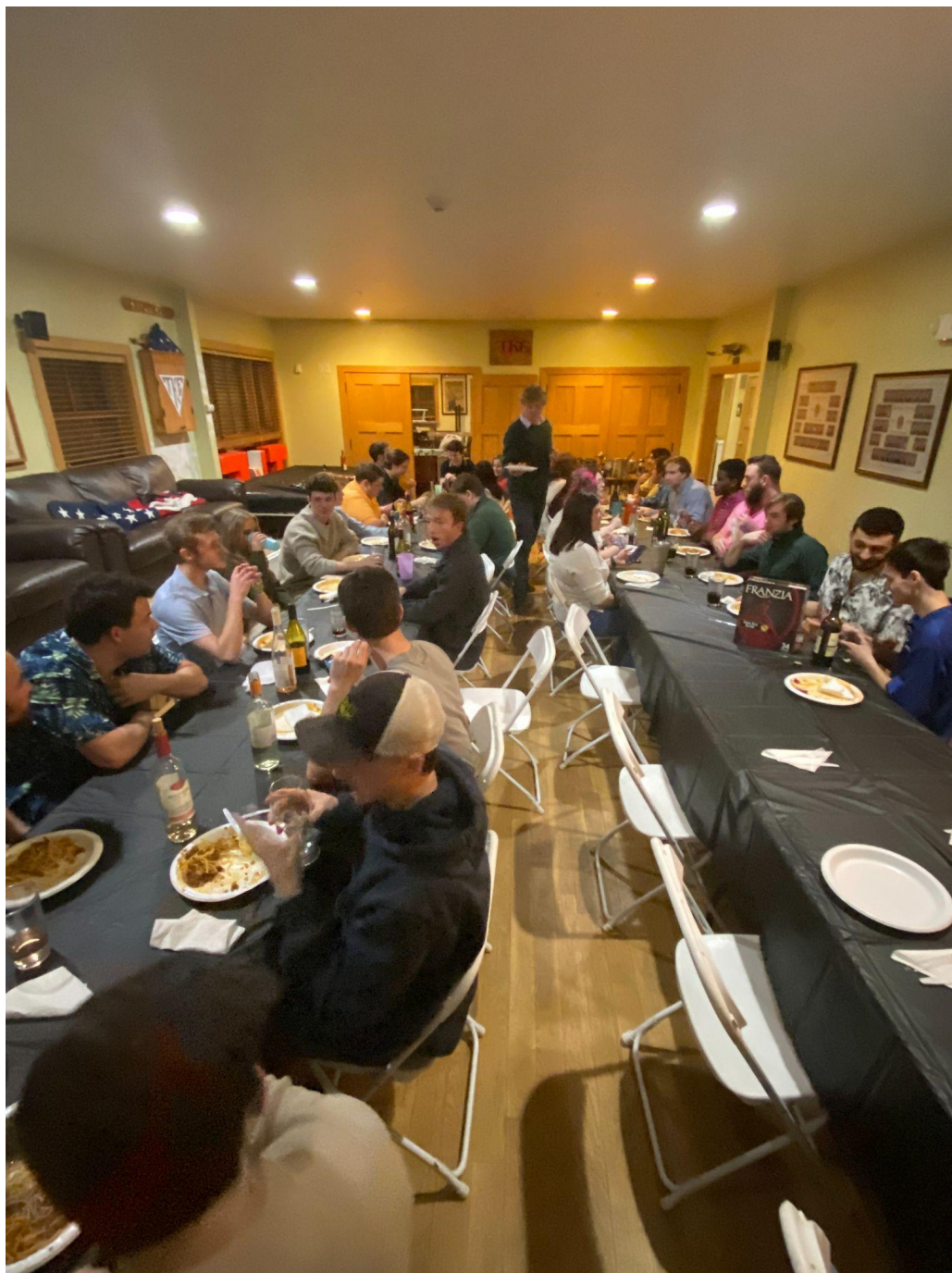
Wine Wednesday with Theta Phi Alpha Sorority